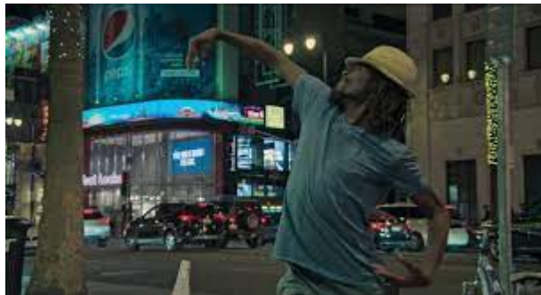
Still image from the documentary Lead Me Home .