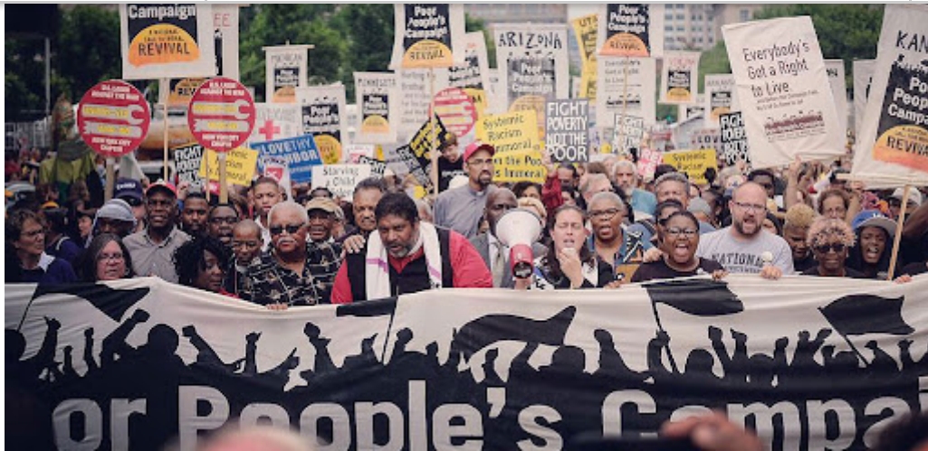
The Reverend Dr. Liz Theoharis and the Rev. Dr. William J. Barber II, co-chairs of the Poor People's Campaign: A National Call for Moral Revival, march with protestors in Washington, D.C., in June 2022.

Rev. Dr. Liz Theoharis, housing advocate and founder of the Poverty Initiative, examines Joe Manchin's obstruction of the Build Back Better Bill and his attack on the Child Tax Credit and living wage proposals in The Nation . Theoharis reports on how the Democrat senator from West Virginia has joined a Florida Republican senator in introducing the PIPES act which cuts funding from the Department of Health and Human Services. The campaign launched with conservative media outlets pushing fake claims that government funds are being used to buy " crack pipes ," all part of a campaign "to scapegoat vulnerable populations rather than address the root causes of the unconscionable conditions under which they live," writes Theoharis. "All of this represents a painful return to the "culture of poverty" debates of the 1960s. Indeed, despite being discredited by scholars and poverty experts over and over since its invention, such anti-poor propaganda seems to rear its head whenever popular opinion and public action might actually lead to improvements in the lives of poor and low-income people."